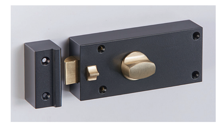
S413 Old Yale Tandem Nightlatch Supplied in powder coated finish